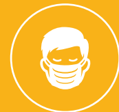
Masks & PPE