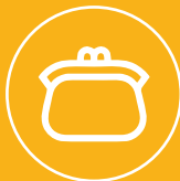
Bags, wallets & purses