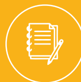
Daily used items (keys, pens etc)